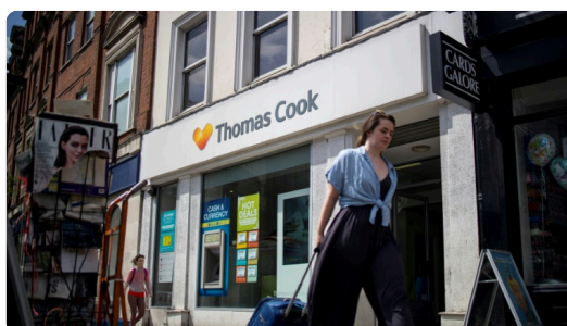
Wednesday, October 9, 2019