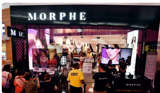
Thursday, January 12, 2023 Morphe and parent company file for Chapter 11 bankruptcy