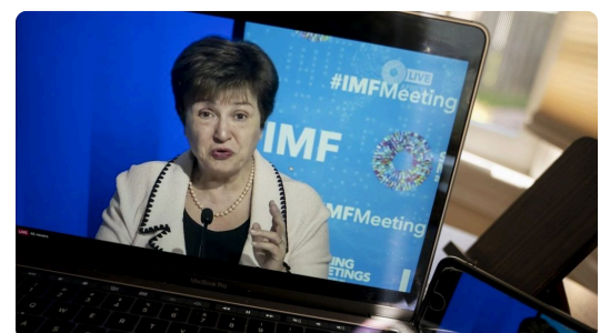
Friday, July 17, 2020