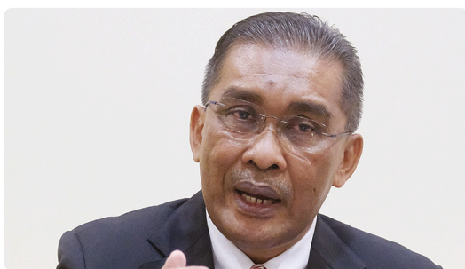
Wednesday, August 5, 2020 Govt to raise bankruptcy threshold