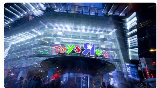
Wednesday, January 24, 2018 Toys 'R' Us says to shut about 180 US stores