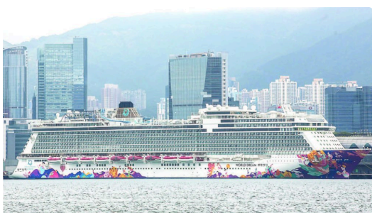
Wednesday, January 19, 2022